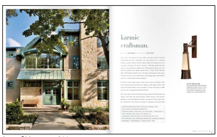
Luxe Chicago, p.211