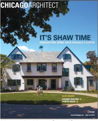
Chicago Architect Sept./Oct. 2012